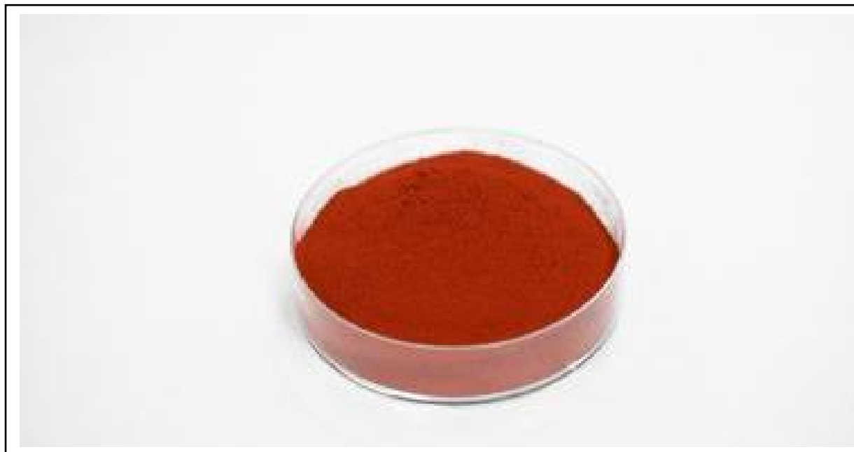
Figure 3: Picture of the declared product.

The iron oxide red products of Zhejiang Huayuan New Materials Co., Ltd. have a complete range of specifications. Their physical forms include powder type and ultrafine powder type, meeting the individualized needs of different customers. These products are widely used in various building materials such as concrete products, cement mortar, stone coloring, asphalt, building coatings, industrial coatings, paints, rubber, papermaking, ceramics, etc.