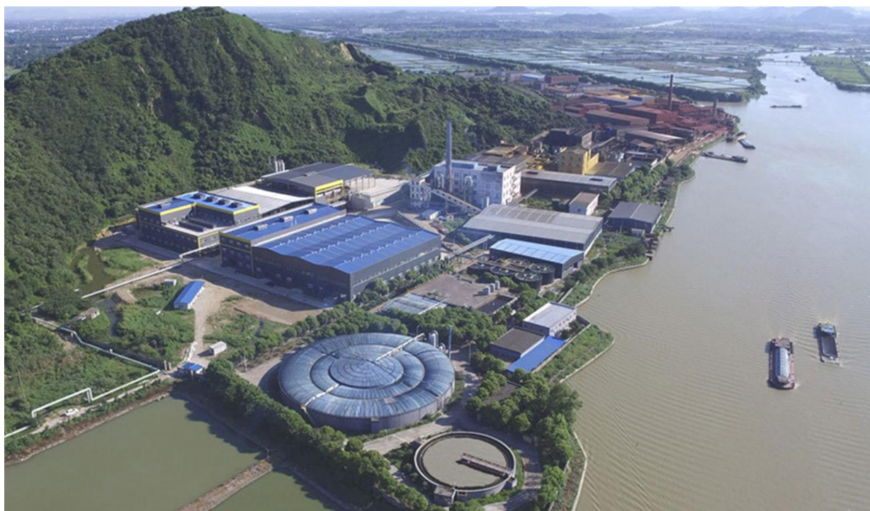
Figure 1: Bird 's-eye view photo of the enterprise

Zhejiang Huayuan New Materials Co., Ltd., established in 1996, is a leading enterprise in the iron oxide new materials industry in Asia and even globally. It holds controlling shares in Zhejiang Huayuan New Materials Sales Co., LTD., Toda United Industry (Zhejiang) Co., LTD., Guangxi Yongfu Huayuan Technology Co., LTD., and Jiaozuo Baili United Pigment Co., LTD. The company covers an area of 350,000 square meters, has nearly 1,000 employees, and produces and sells nearly 240,000 tons of iron oxide series products annually. Its products are sold in all provinces, municipalities and autonomous regions of China as well as over 80 countries and regions on five continents.