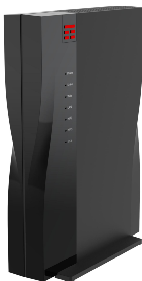
Figure 3: Picture of TIM HUB Pro, GPON ONT-ZXHN F6745M