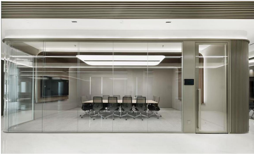
Figure: Picture of the declared product.

The Double glazing partition produced by Clestra Hauserman (Taicang) Architectural Products Co., Ltd. is typically a partition product made primarily of aluminum profiles and glass, widely used in industrial and commercial construction fields. It belongs to the United Nations Standard Product Classification Code: 421 (Metal Structures and Parts). The double glazing partition feature soundproofing, heat insulation, and decoration, enhancing aesthetics and creating quiet spaces.