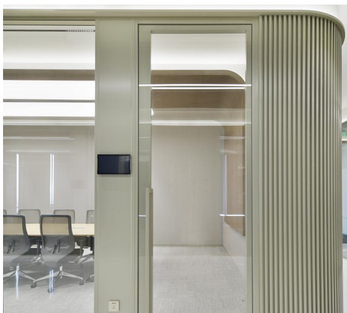
Figure: Picture of the declared product.

The flush glazing door produced by Clestra Hauserman (Taicang) Architectural Products Co., Ltd. is a modern architectural door and window option. It not only provides excellent lighting effects for buildings but also combines aesthetics and practicality. It is widely used in high-end office buildings, hotel lobbies, commercial centers, and other places, creating a sense of transparency and spaciousness for indoor spaces. It belongs to the United Nations Standard Product Classification Code: 421 (Metal Structures and Parts).