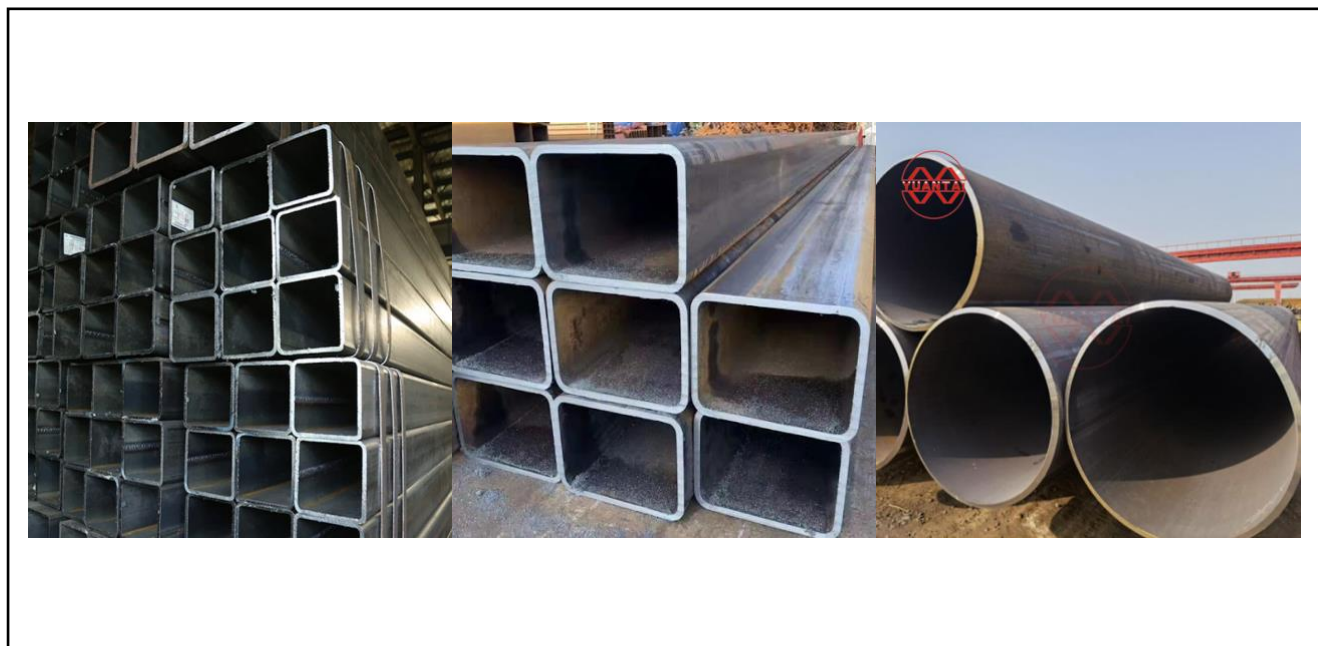
Figure 1 Picture of the declared product.