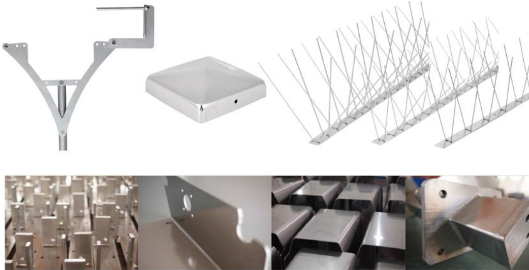
Figure 3: Picture of the declared product.