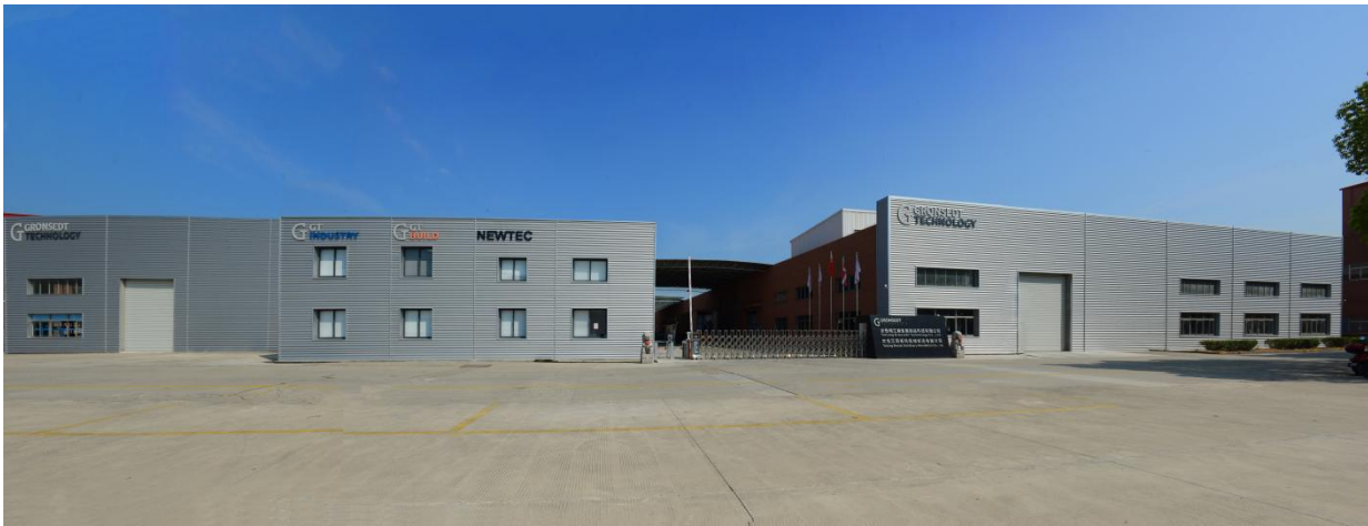
Figure 1: Picture of the company

Gronstedt Technology is a private, family-owned Danish company group established in 2007. We specialize in the design, production, and sale of stainless steel and aluminum products. Our offerings include both mass-produced products for the construction industry through our GTINDUSTRY division, as well as smaller series and customized products for a variety of industries through our GTINDUSTRY division. With a presence in Europe, Asia, and the Middle East—including our own factories, central warehouse, and distribution center in China—we supply products to customers worldwide, either directly or via our distribution center in Denmark for European clients.