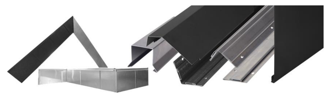
Figure 3: Picture of the declared product.