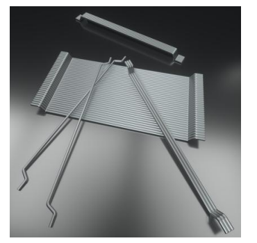
Figure: Picture of the declared product.