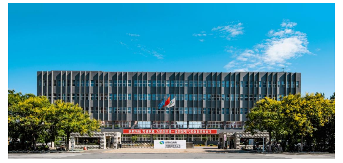
Figure 1 XJ Metering Co., Ltd

Established in 1999, XJ Metering Co., Ltd, one of core subsidiaries of XJ Electric CO., LTD, is specializing in Standard Formulation, Intelligent Metering, Data Acquisition and Communication, Test and Inspection and Energy Management System. The core businesses of XJ are smart power distribution, UHV power transmission, smart power utilization, smart grid, new energy, electric vehicle charging and swapping, and advanced energy storage. Equipped with advanced logistics and warehousing systems, the whole process of intelligent testing system and manufacturing information management system, XJ Metering can provide comprehensive and reliable solutions for the whole chain and life cycle of the metering system.