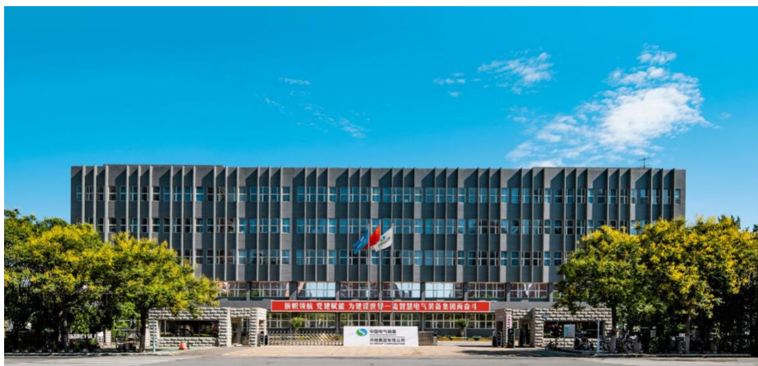
Figure 1 XJ Metering Co., Ltd

Established in 1999, XJ Metering Co., Ltd, one of core subsidiaries of XJ Electric CO., LTD, is specializing in Standard Formulation, Intelligent Metering, Data Acquisition and Communication, Test and Inspection and Energy Management System. The core businesses of XJ are smart power distribution, UHV power transmission, smart power utilization, smart grid, new energy, electric vehicle charging and swapping, and advanced energy storage. Equipped with advanced logistics and warehousing systems, the whole process of intelligent testing system and manufacturing information management system, XJ Metering can provide comprehensive and reliable solutions for the whole chain and life cycle of the metering system.